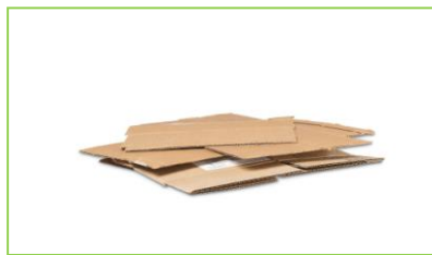
Cardboard 12" x 12"