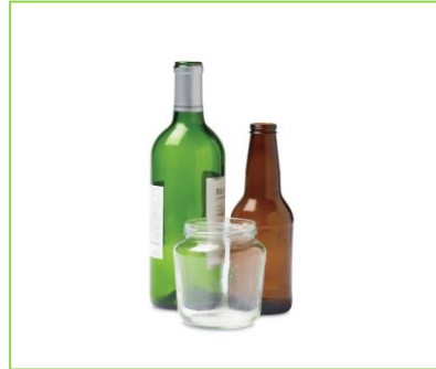
Glass-Clear, Brown, Green