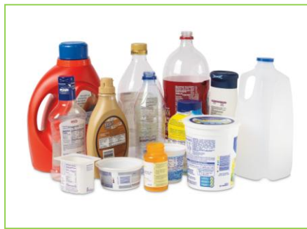
Plastic Codes (1,2,3,4,5,7)